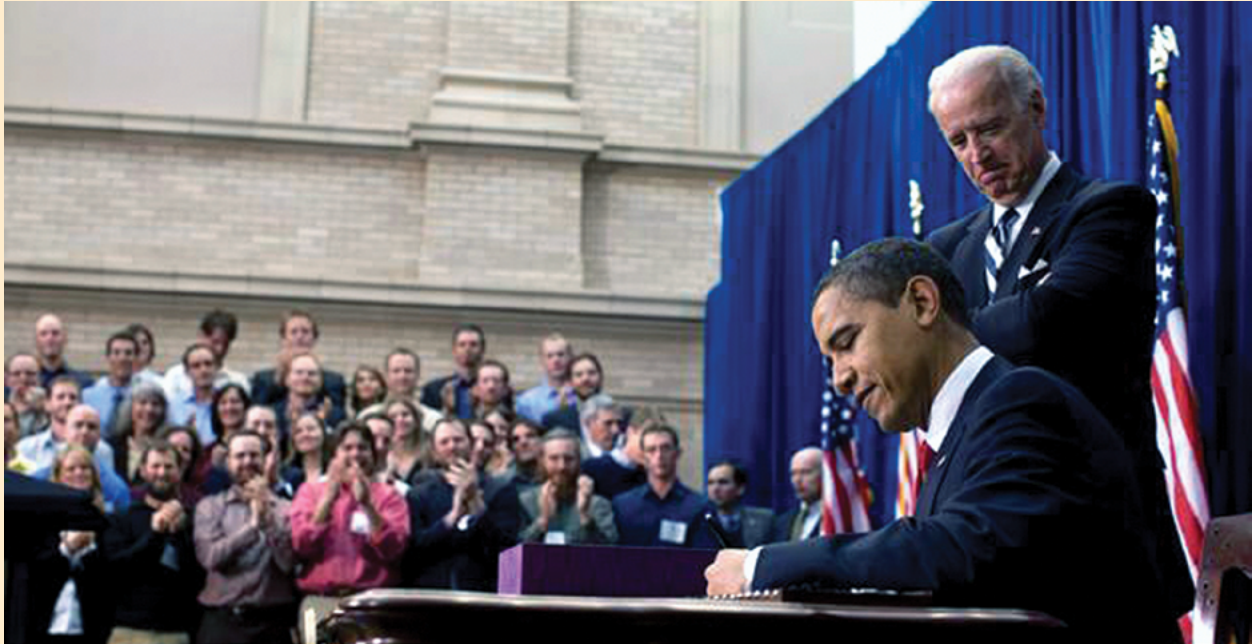
Pete Souza, White House photographer