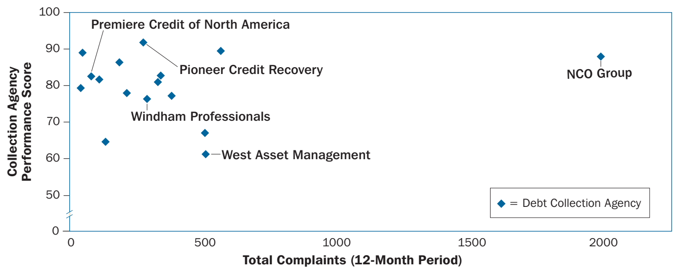
Source: Complaints: Federal Trade Commission (2012); Better Business Bureau Complaints (Mar 17, 2011-Mar 16, 2012). Scores: U.S. Department of Education (NCLC Freedom of Information Act Request). One collection agency, FMS Investment Corp., was omitted due to missing complaint data.

There is no discernible relationship between the number of complaints about a collection agency and the overall evaluation score given by the Department of Education. (See Appendices A and B for details.)