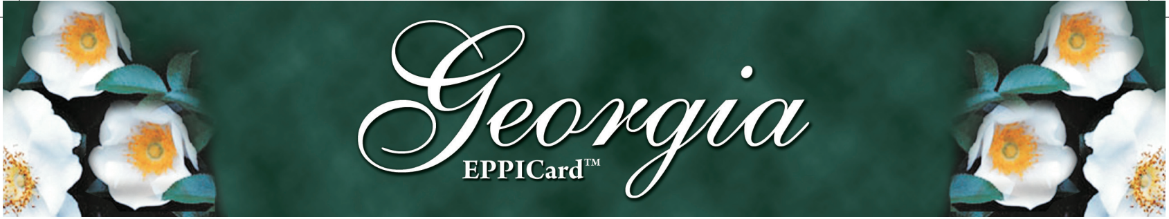
EXHIBIT 20: GEORGIA