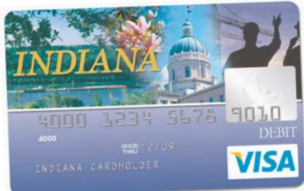
The Indiana Debit Card is issued by PNC Bank pursuant to a license from Visa U.S.A. Inc.