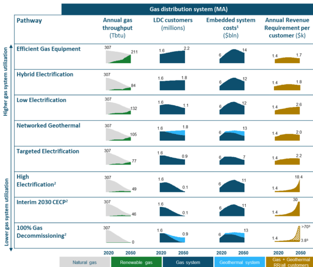
Figure 3. Transformations in the gas system by pathway ($2020, 2020 – 2050).