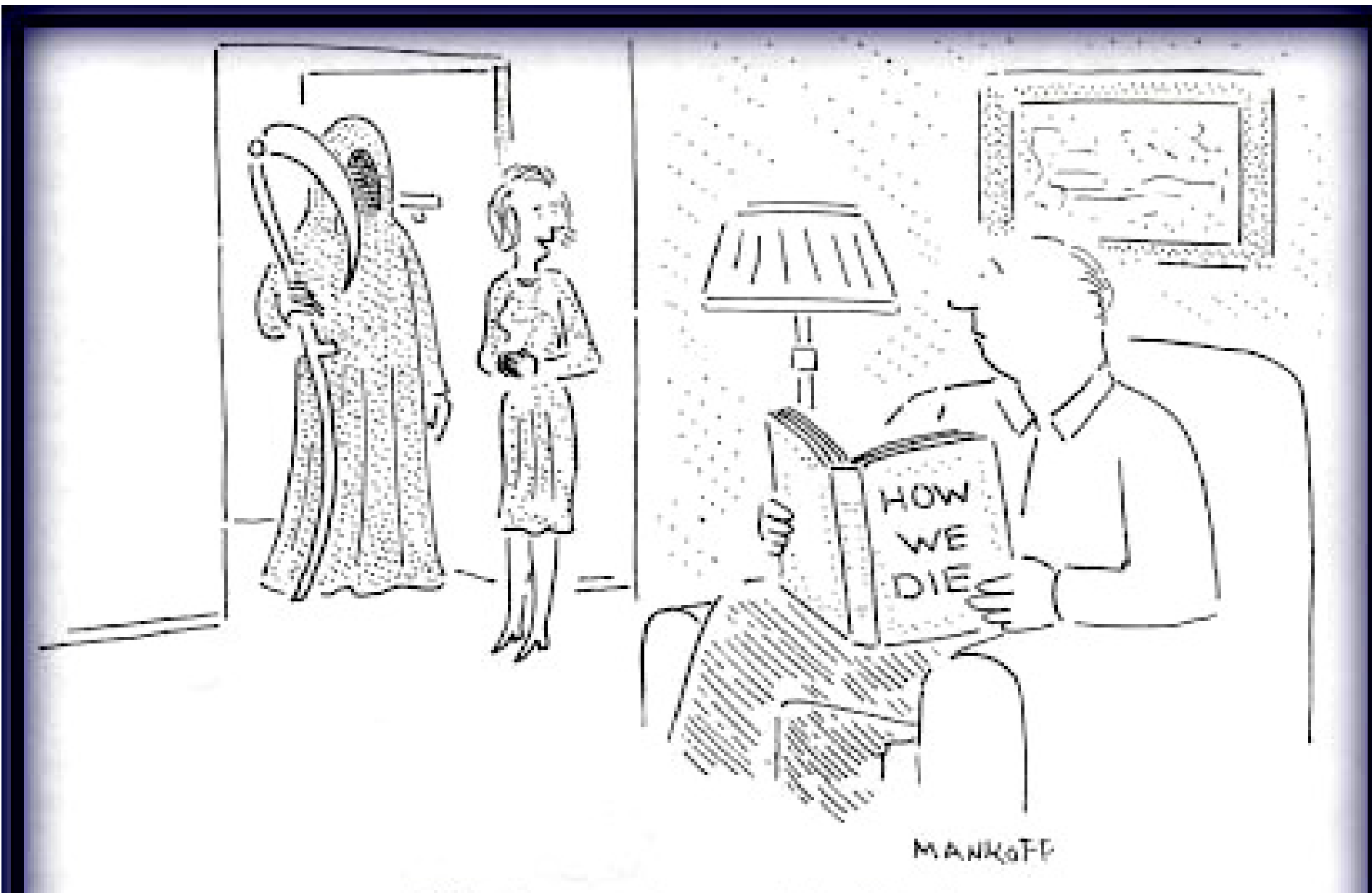
"My, oh, my, what a co-inky dinky."