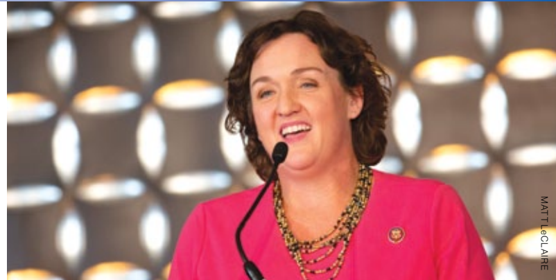
U.S. Representative Katie Porter addresses Celebration guests

A short trailer was shown for an NCLC-focused episode of the documentary TV series Visionaries , hosted by actor Sam Waterston, which began airing on PBS stations across the country this summer. The program profiles NCLC attorneys and partners at legal-aid organizations in Detroit and Atlanta, highlighting some of the many economic injustices that plague low-income people, families and communities, and the advocates who work to bring them justice. To see the trailer